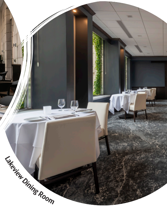
Lakeview Dining Room